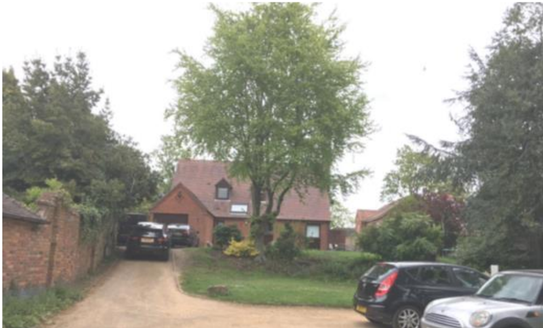
Rectory, Bradford Lane, Belbroughton, DY9 9TF

The Rectory is located in Belbroughton and is close to both the church and the church office. It is currently undergoing considerable refurbishment to meet the needs of modern living.